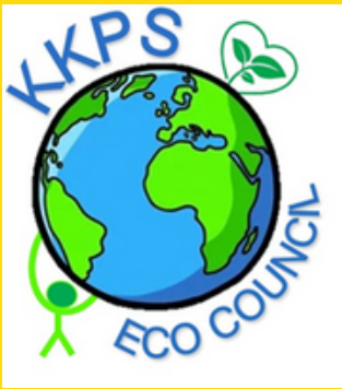
OUR NEW LOGO!

The Eco Council have had a busy year so far with lots of eco-friendly action to help make our school a greener place.